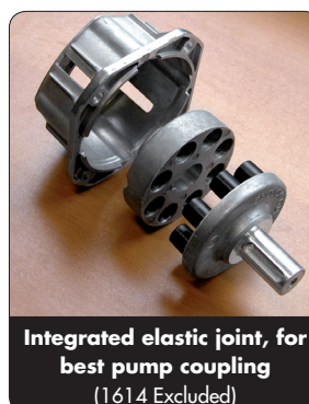
Integrated elastic joint, for best pump coupling (1614 Excluded)